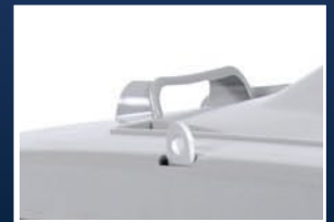
Hasp lock adaptor