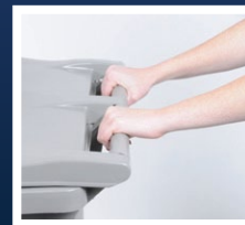
Durable and strong handles